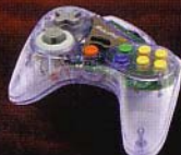
MakoPad ® 64