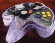
SharkPad Pro 64 ®