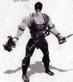
Duke Nukem™-Night Strike