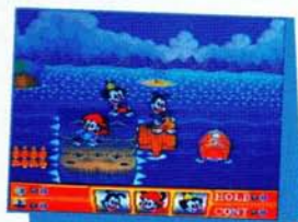
Aquatic film stage