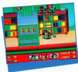
No. of Script Scenes

The final scenario of the game varies depending on whether or not you've collected the entire script when the game ends.