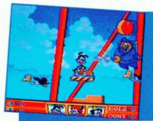
Recovery Stage screen