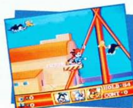
Water Tower/ Rescue stage