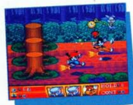
Fantasy film stage