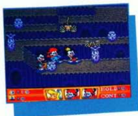
Sci-Fi film stage