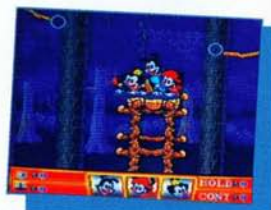
Adventure film stage