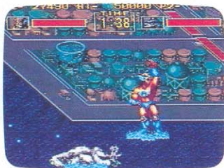
Special attack technique during POWER-UP level 2