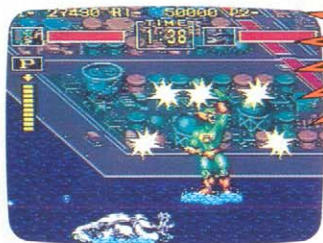
Special attack technique during POWER-UP level 1

You can POWER-UP to two levels. After and above that, any more POWER POINTS will be added to your total score.