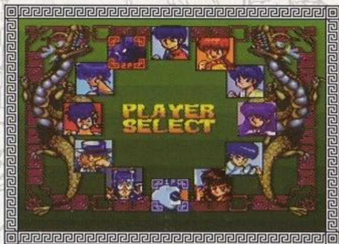
Characters Clockwise from Top Center: Ranma, Ranma-chan, Akane, Shampoo, Mousse, Ukkyo, Genma, Gosunkugi, Gambling King, Ryoga, Pantyhose, Pantyhose (transformed).

Press LEFT or RIGHT on the Control Pad to select your favorite character, and press the START Button or the Y Button. The B Button lets you cancel your choice. You cannot change your character while playing in a tournament.