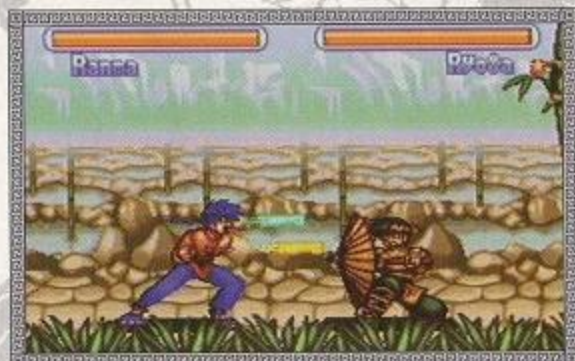
RANMA - SWEET CHESTNUT FIST

Thinking that he would be excused from school exams if he could beat the fighters chosen by the principal, Ranma firmly resolved to devote his time to martial arts training, rather than to the pursuit of academic discipline.