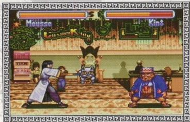
MOUSSE - POUNCING CAT