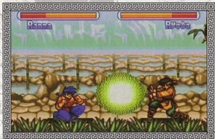
RYOGA - LION'S ROAR BULLET

Ryoga, the wanderer, accidentally lost his memory. He was taken in by the principal's slick talk and fooled into fighting faces from his past - even Akane, his heart-throb! What a loser!