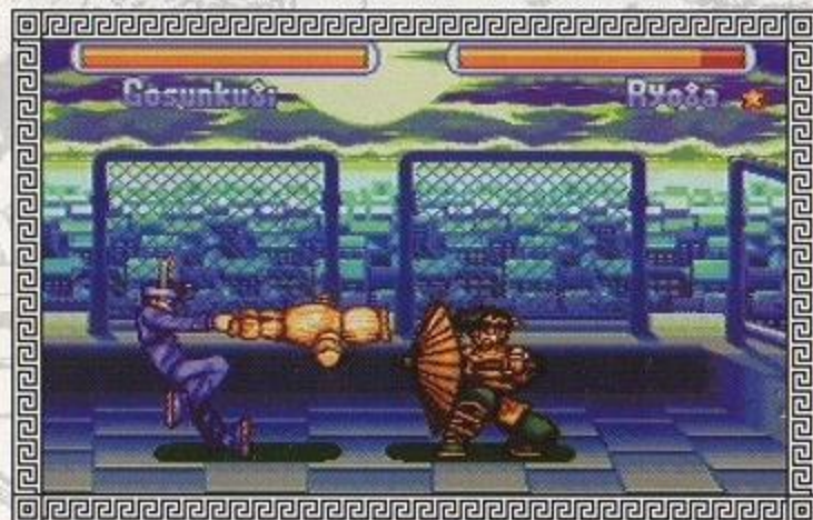
HIKARU - GIANT SPINNING STRAW MAN

When it comes to gloom and doom, Hikaru Gosunkugi is number one on the list at Furinkan High School. With a push from the principal, he's ready for his own personal pursuit, completely armed with candles tightly secured to his head. Now, he's full of dark power!