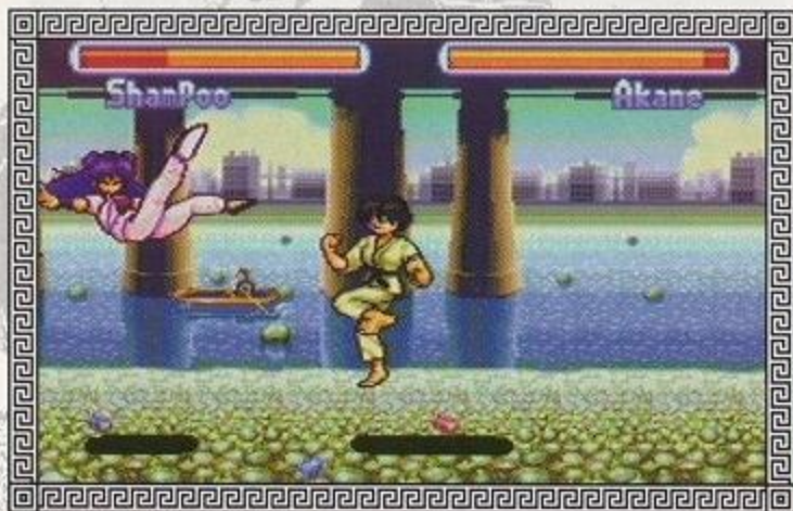
AKANE - FLYING KNEE KICK

Akane is surrounded as usual by a hoard of boys asking her for a date. Her daily routine is to blast them off with a single blow. She pleaded with the principal to impose tighter school discipline. As you might expect, the principal has come up with something a little different.