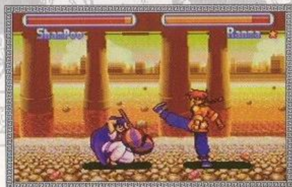
RANMA-CHAN - BASIC KICK