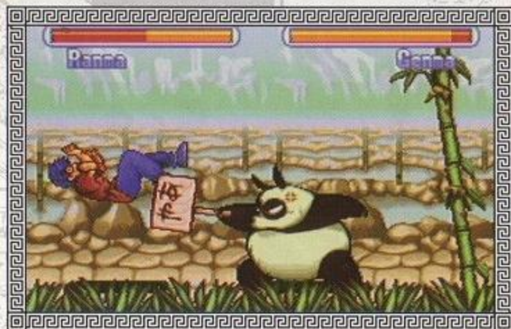
GENMA - SIGNBOARD PUNCH

Having a rebellious son like Ranma has been a big headache and heartache for Genma Saotome. After hearing the principal's pep talk, Genma resolved to achieve his ultimate strength by any means available. In this way he could demonstrate his paternal dignity to the world. Even if it means transforming into a Panda!