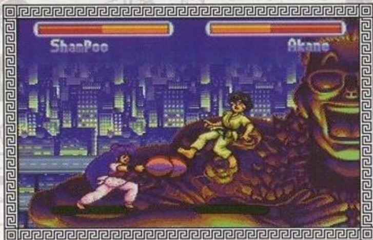
SHAMPOO - LANTERN PUNCH

Even though she puts a lot of energy into researching arcane potions, Shampoo has yet to enchant Ranma's heart. Then, she discovered the great tradition of Chinese proverbs!