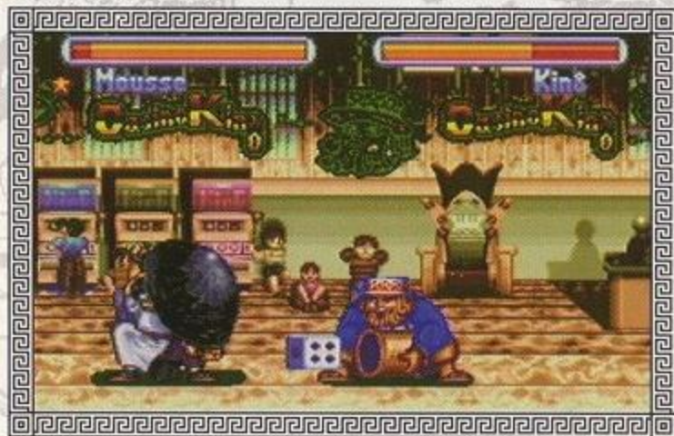
GAMBLING KING - DICE HOOK